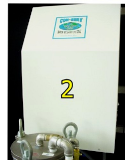
Wall Mount Ozone & Oxygen Units